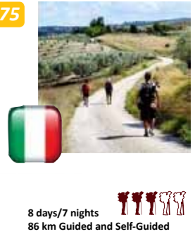
8 days/7 nights 86 km Guided and Self-Guided

One of the most spectacular stretches of the entire Via Francigena, or Italian Camino to Rome. From San Miniato, the path takes you through a typical Tuscan landscape of rolling hills, forested valleys and vineyards. Explore unique medieval towns along the way including San Gimignano, Monteriggioni and beautiful Siena, the goal of your journey.