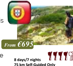
From €695 8 days/7 nights 75 km Self-Guided Only

A magnificent coastal path in a remote region of southwest Portugal. Along this little-known trail starting in the seaside town of Odeceixe, you will encounter age-old fishing spots, looming cliffs and wonderful biodiversity. This route also showcases an impressively diverse array of plants and bird species.